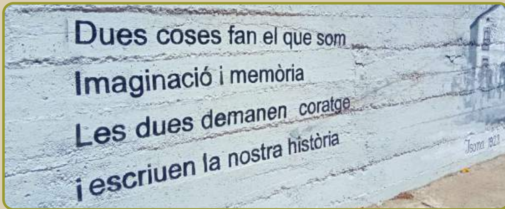
Carrer Sant Sebastià, Isona, 2022

Dues coses fan el que som Imaginació i memòria Les dues demanen coratge i escriuen la nostra història.