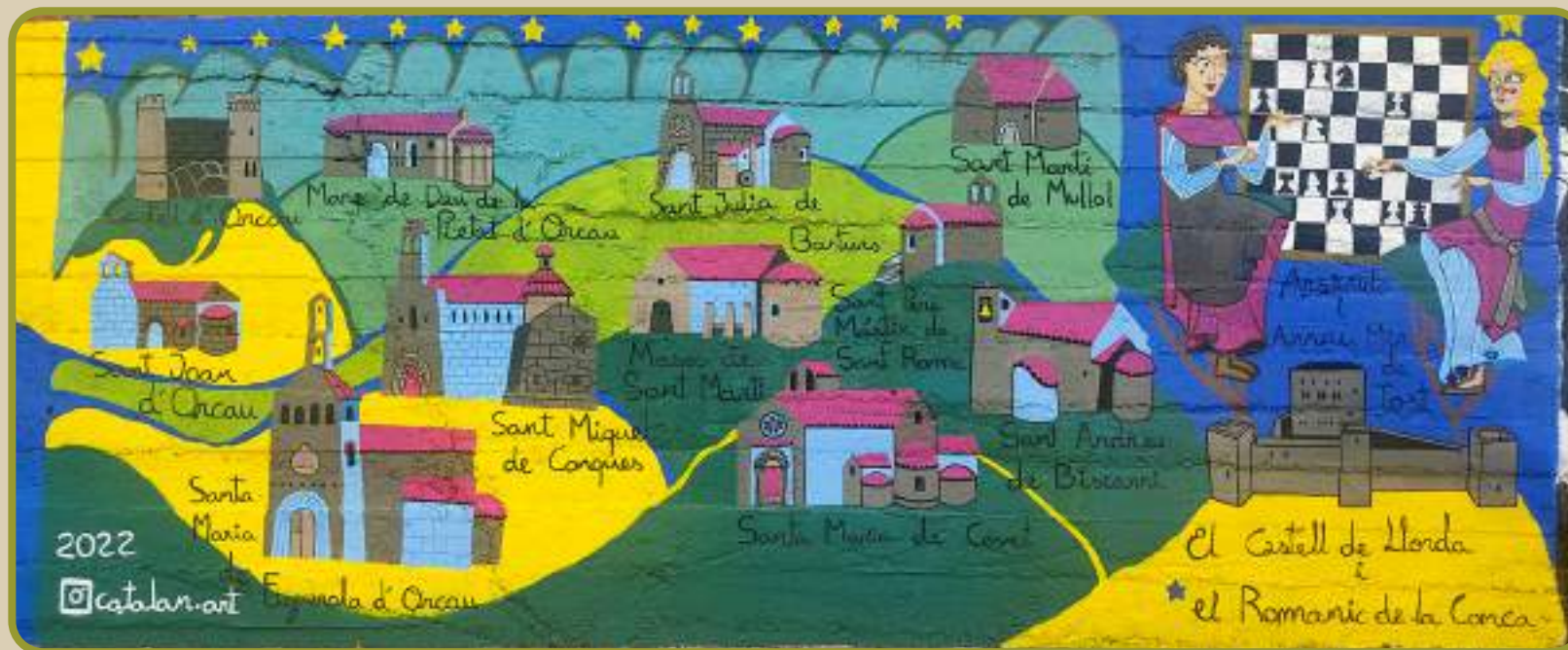
Carrer Sant Sebastià, Isona, 2022

My mural highlights Arsenda d'Àger (1015-1068), a woman of great culture and a philanthropist, whom I represent playing chess with her husband Arnau Mir de Tost, to whom she bequeathed the board and the crystal pieces " tabulas nostras et eschachos vadant secundum mandamentum senior ". This proves that the Pallars and the Pyrenees were the gateway to the expansion of the popular game in Europe.