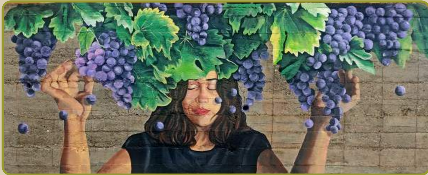
Carrer Sant Sebastià, Isona, 2022

The second intervention is a single 6 m x 2.5 m mural.