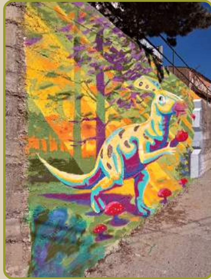
Carrer Sant Sebastià, Isona, 2021