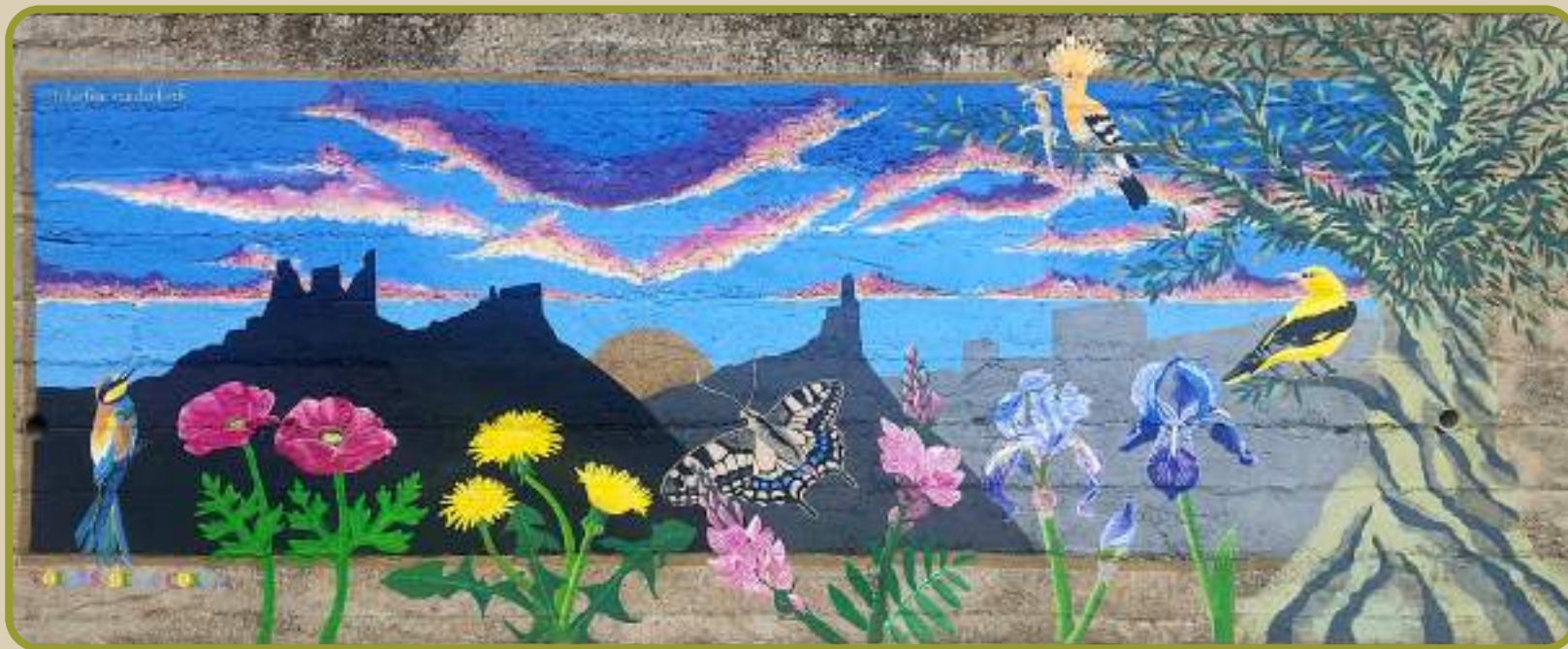
Carrer Sant Sebastià, Isona, 2021

In this mural we see a contrast between things that last and those that are more ephemeral. The castles and an olive tree that have lasted for centuries, even up to a millennium. On the other hand, plants that only bloom for days or weeks, the butterfly that does not live for a month and the birds that visit us only during the summer.