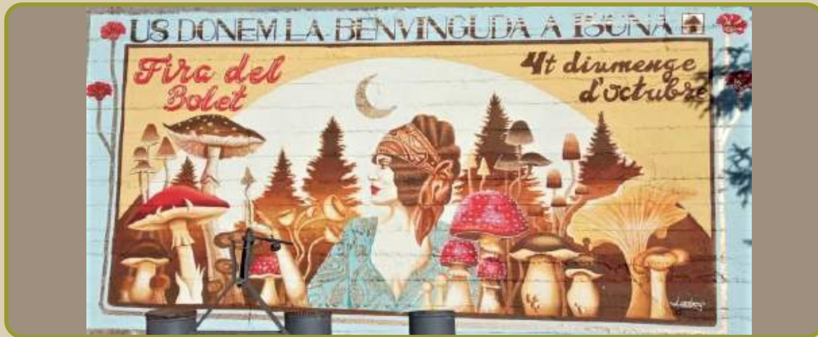
Carrer de la Pobla (C-1412bz), Isona, 2021

This mural advertises the Mushroom Fair that takes place on the 4th Sunday of October every year.