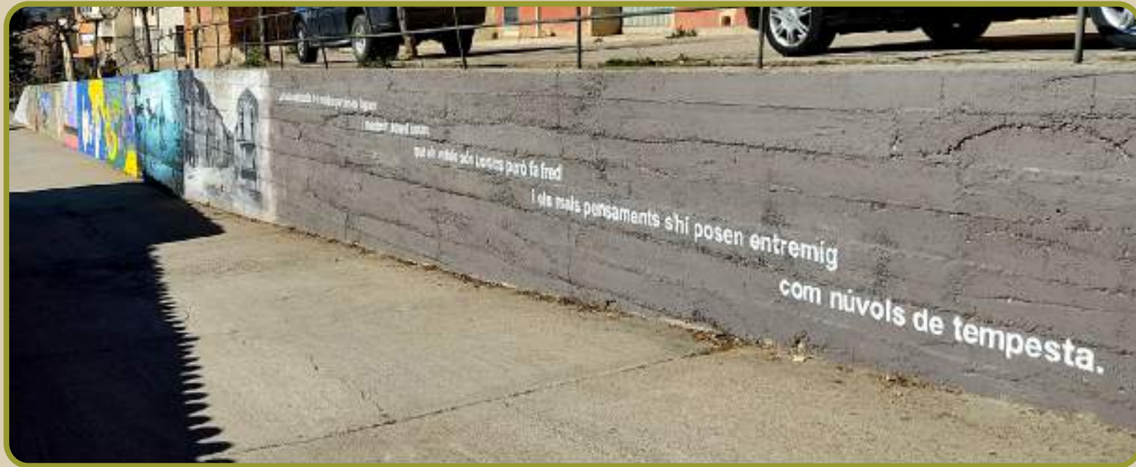
Carrer Sant Sebastià, Isona, 2022

La fusta dels fusells jo la voldria per fer-ne bigues i mantenir aquest sostre que els estels són bonics però fa fred i els mals pensaments s'hi posen entremig com núvols de tempesta.