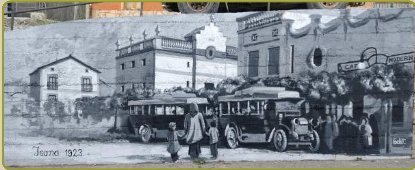
Carrer Sant Sebastià, Isona, 2022