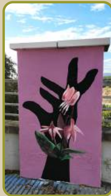
Carrer del Vall (C-1412bz), Isona, 2021

The starting point for the pictorial interventions on the walls of Isona was their connection with the territory. Finding the links that tie me to this land and landscape I went for images that merge my inner and artistic world with the flora of the Pre-Pyrenees.