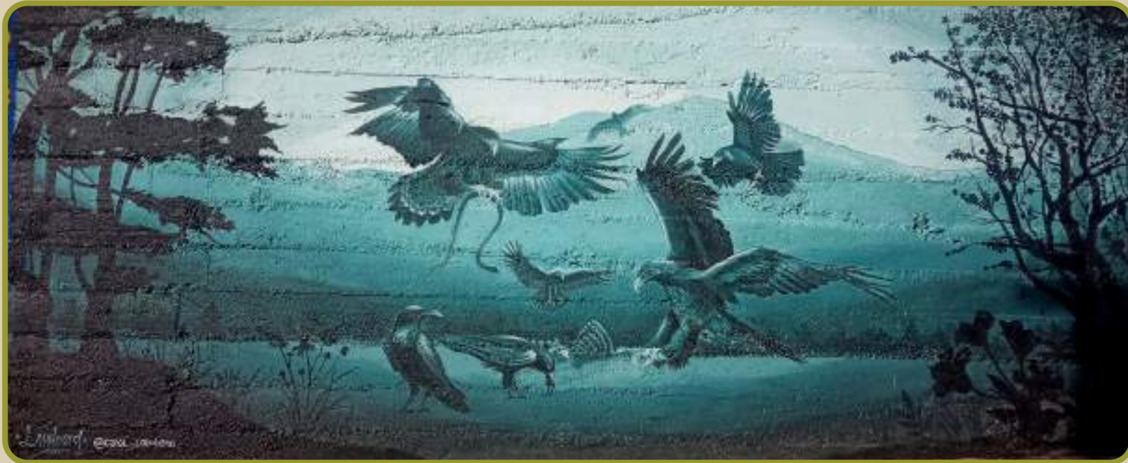
Carrer Sant Sebastià, Isona, 2022

This wall represents a detail of the local flora and fauna, with a dark aesthetic that captures the moment when the birds (eagles, crows and kites) hunt their prey.