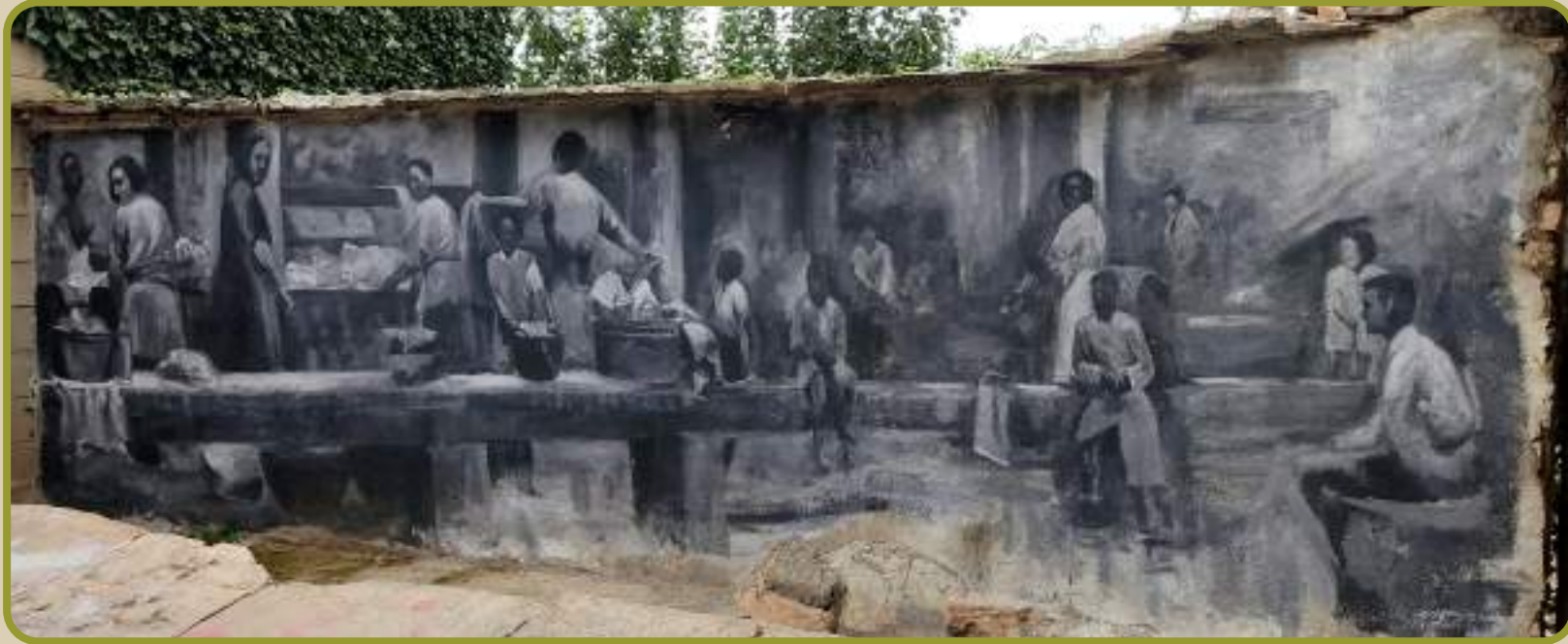
Carrer de la Pobla (C-1412bz), Isona, 2021

This mural wants to represent the daily life of the women of the past. When they went to wash their clothes in the washing area by the fountain, it was a time for conversation and exchanging experiences.