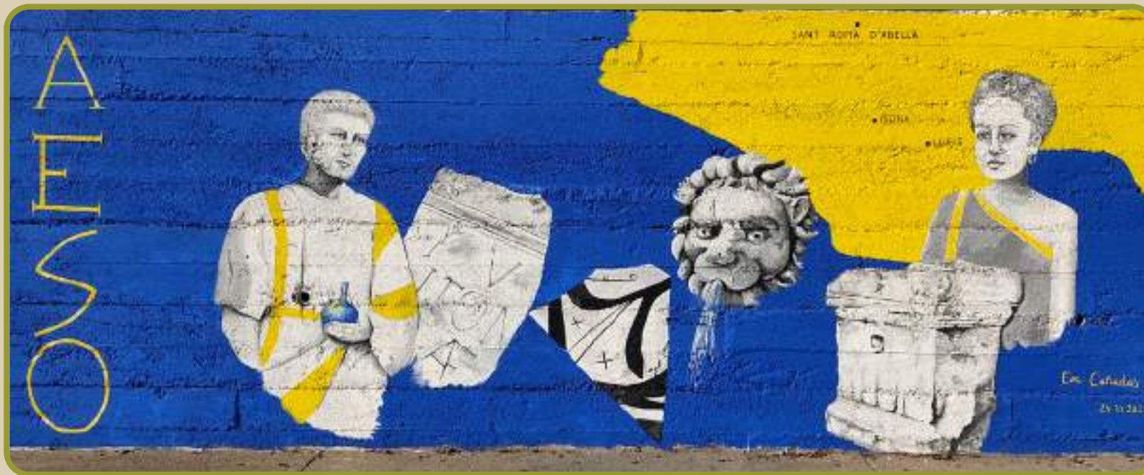
Carrer Sant Sebastià, Isona, 2021

The work depicts two of the most important characters of the history of Aeso and archaeological elements found in the excavated sites: Luci Emili Patern and his mother-in-law Atilia Paterna.