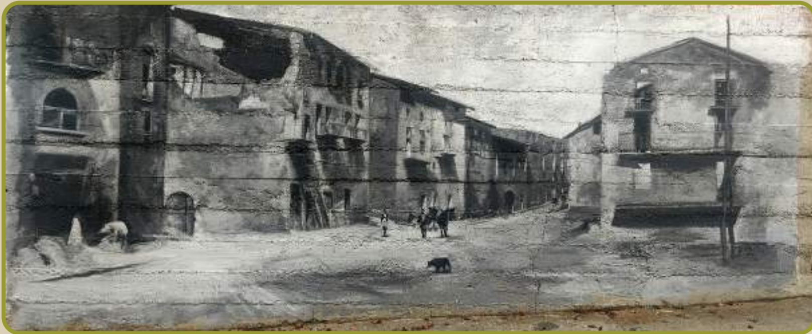
Carrer Sant Sebastià, Isona, 2022

This mural represents the state the Isona Square (or Portal Square) was in right after the war.